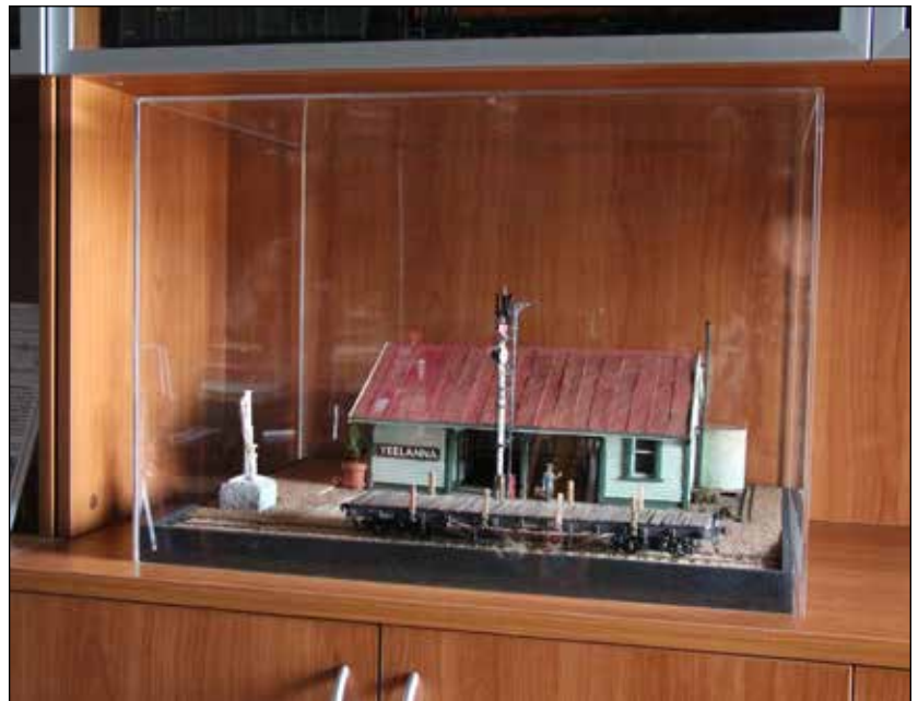
Below: Ralph Holden's models on display in the reading Room at the Museum.

Models such as these are ideal for illustrating the story of how rail served Eyre Peninsula for over a century. The Museum is very grateful to the Holden family for entrusting these superb models to our care.