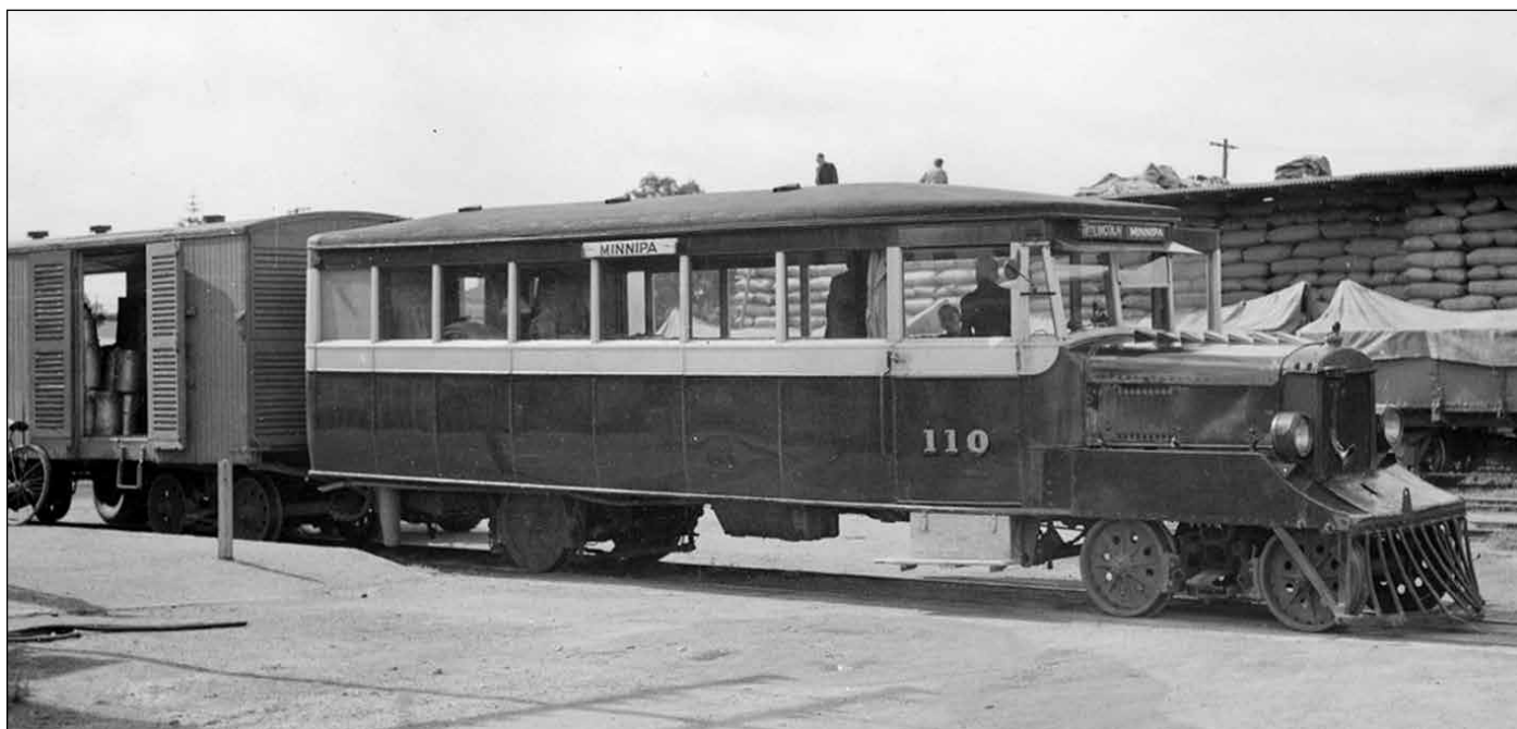
Above: Fageol 110 is ready to leave Port Lincoln on a Minnipa service.

110 was sent to Islington Workshops in 1960, leaving 109 as the last one running.