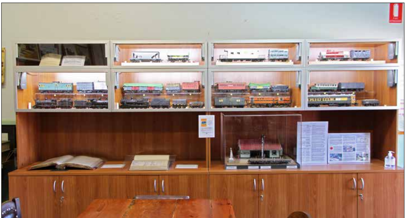
Above: This diorama includes the Yeelanna station building, Train Order signal and water column as well as a bogie flat wagon.